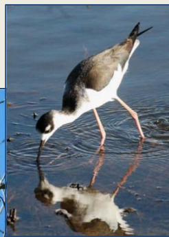
Black-necked Stilt, Dale Garrison