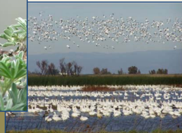
Snow Geese in Rice, Ducks Unlimited, Inc.