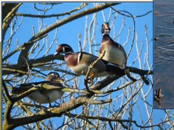
Wood Ducks