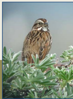
Song Sparrow, Brian Gilmore