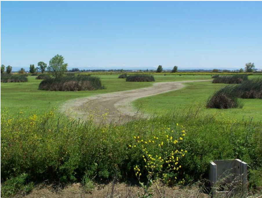
Figure 9. Wetland Swale. Swales can be designed into restoration or enhancement projects to facilitate rapid flooding and remove standing water during spring draw-down.

BMPs: Independent water management, Adequately sized water control structures, Swale construction, Wetland size consideration, Ditch design, Levee design & compaction, Deep channels or basins constructed in seasonal wetlands, Permanent water reservoir that floods into seasonal wetlands (for additional explanation see Table 4)