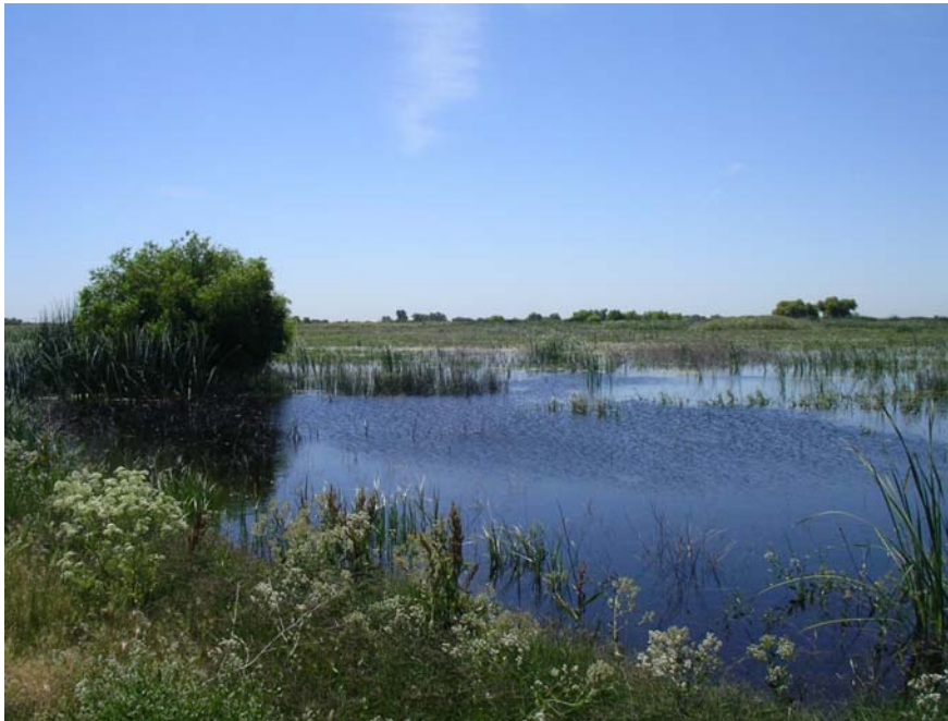
Figure 3. Semi-permanent Wetlands. Semi-permanent wetlands provide critical habitat for resident wildlife at a time of year when most seasonal wetlands are dry.

Semi-permanent and permanent wetlands comprise only 5-15% of the total managed wetlands in the Central Valley (Central Valley Habitat Joint Venture 1990). Semi-permanent wetlands are typically flooded from October through mid-July and permanent wetlands are flooded year-round. These habitat types are often characterized by a combination of open water, emergent vegetation (e.g., cattails ( Typha spp.), tules ( Scirpus acutus ), and other bulrushes), and submergent aquatic vegetation (e.g., horned ( Zannichellia palustris ) and sago pondweed ( Potamogeton pectinatus )). They provide habitat important to resident wildlife, and provide breeding and molting habitats for waterfowl at a time of year when most seasonal wetlands are dry (Ducks Unlimited 1995b). Semi-permanent wetlands are drawn down after the breeding season, and measures such as disking, mowing, or burning are commonly used to manage vegetation growth. Permanent wetlands are typically drawn down every three to five years to recycle nutrients and increase productivity and, in some cases, control undesirable fish populations (e.g. carp). Similar to other managed wetland types, undesirable vegetation in permanent wetlands is typically controlled through disking, mowing, or burning.