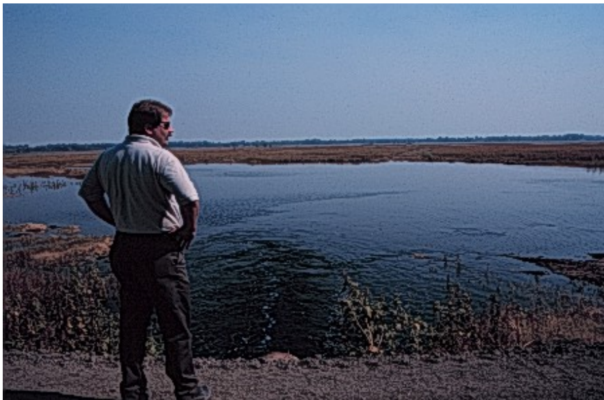
Figure 5. Rapid Flooding. Rapid flooding should be used to reduce the potential for multiple hatches of mosquitoes caused by slow feather-edge flooding.

BMPs: Rapid fall flooding, Rapid irrigation (see Table 1 for additional explanation)