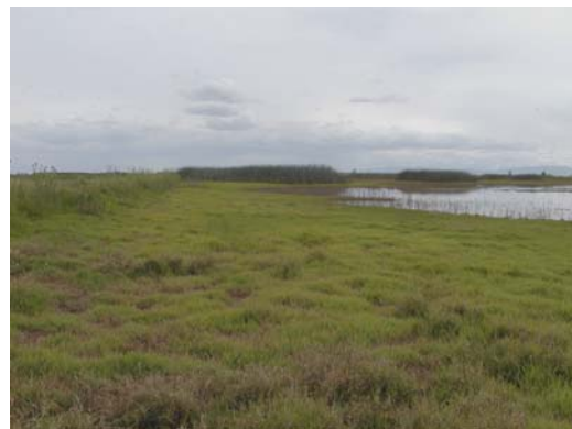
Figure 7. Vegetation Disking and Dense Bermuda Grass ( Cynodon dactylon ). Dense stands of bermuda grass are known to harbor mosquitoes (Garcia and Des Rochers 1983). Bermuda grass also tends to limit habitat diversity in seasonal wetlands and is targeted for control by wetland manager using disking.

Haying and Grazing: Agricultural practices such as haying and grazing may also be useful to control wetland vegetation. However, little information is available on their effectiveness as mosquito control measures. Haying, while functionally similar to mowing, may provide the same mosquito control benefits. Haying has the potential added benefit of removing cut plant material that may decay and negatively affect water quality, thereby increasing mosquito production (Brown, pers. comm). However, haying removes valuable