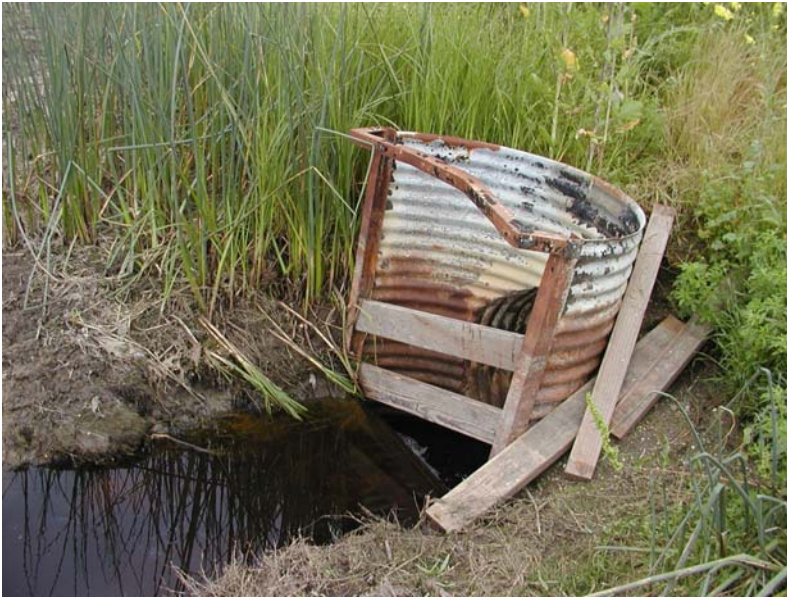
Figure 8. Faulty Water Control Structure. Defective water control structures should be replaced with structures that can be completely sealed to prevent water seepage.

Ditch and Swale Cleaning: Vegetation in water delivery ditches and swales can be problematic by creating habitat for mosquitoes or by simply impeding the flow of water that facilitates rapid flooding or drainage. Typical maintenance activities of water delivery and drainage ditches include the use of herbicides or periodic dredging to remove problem vegetation that inhibits water flow. Ditches and swales should be cut to grade to prevent the unintentional trapping of water. Likewise, silt that accumulates in front of outlet structures should be removed so it does not trap water in drainage swales.