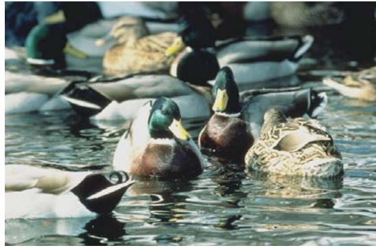
Figure 2. Watergrass ( Echinochloa crusgalli ) and Wetland Irrigation. Wetlands are often irrigated to grow seed producing plants, such as watergrass, to meet the energetic requirements of migratory waterfowl and to reduce crop depredation by attracting waterfowl to wetland areas.

method to control undesirable plant species, such as cocklebur (Ducks Unlimited 1995a).