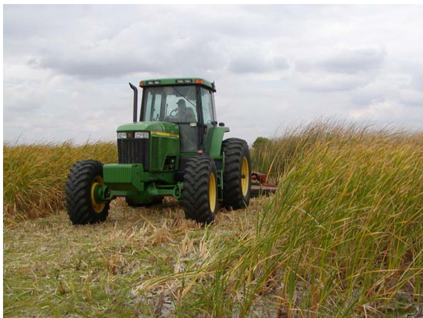
Figure 6. Vegetation Mowing. Mowing can be used to create open water habitat and reduce mosquito densities. If mosquito control is necessary, mowing can concentrate mosquitoes and enhance pesticide application by allowing better penetration of vegetation.

Mowing: Mowing is commonly used to create open water habitat for shorebirds and waterfowl prior to flooding seasonal wetlands. Mowing to create open water provides opportunities for the biological control of mosquitoes and enhances the effectiveness of pesticides by allowing greater saturation of mosquito habitats. Experimental mowing of approximately 50% of a wetland has been shown to reduce the density of mosquitoes and concentrate their distribution while increasing densities of invertebrates that are consumed by waterfowl (Batzer and Resh 1992a). Similarly, Garcia and Des Rochers (1984) found